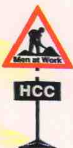
Men at work with stand