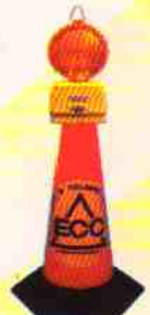
Cone with Dorman Flasher