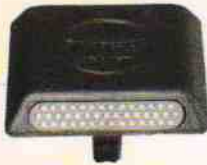
Aluminium Road Stud