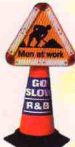
Cone with Men at Work