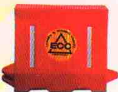
Parabolic Crash barrier