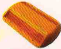
Stimsonite Road Stud