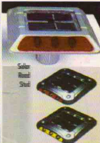
Solar Road Stud