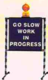
Message Board with Flasher