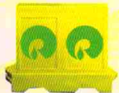
Crash Barrier (Sponsor)