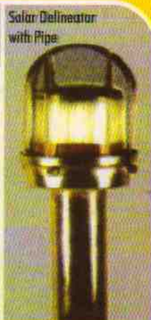
Solar Delineator with Pipe